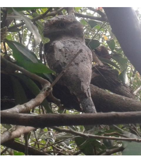
2) Male Frog mouth